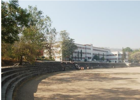
The Loyola Connection

The year 2021 is an important milestone in FIDA's journey as we complete 15 years of trying to reach out and make a difference.