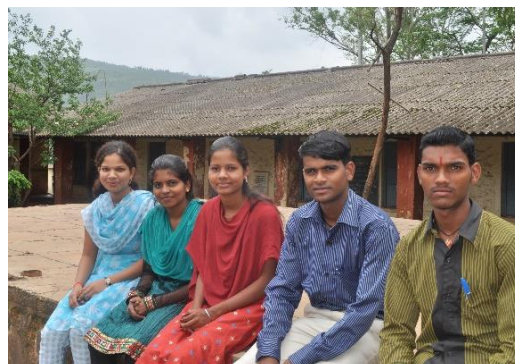
First Batch of FIDA Scholars