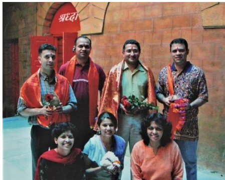
First School visit