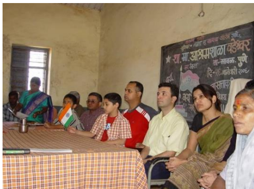
First Project (2006)